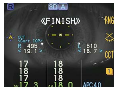
Compensated patient's IOP