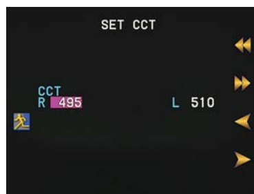
Entered patient's corneal thickness